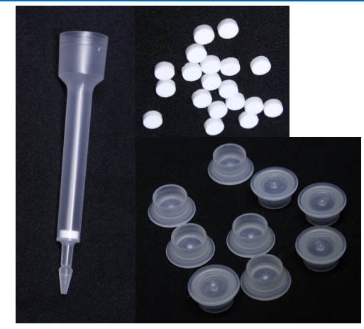
Eichrom snap tip 2 mL Columns (AC-141-AL) come with the bottom frit inserted. Top frits and column top caps are also included.

Summary Eichrom offers empty 2 mL columns and bulk resin for customers who wish to pack their own columns. This application note will offer advice on slurry packing columns that will exhibit favorable flow conditions and efficient separations. Some hydrophobic, difficult to wet resins may require additional treatment prior to slurry packing or may be dry packed.